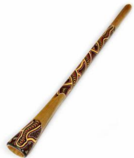
c) Aboriginal instrument that dates back 40,000 years