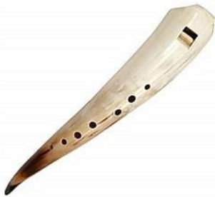
a) 15 th century – from the Ocarina family

Can you name these? (Answers on the back Page)