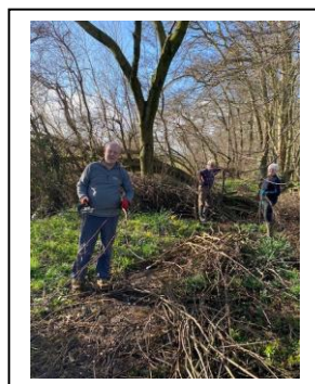
Great morning's result!