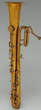
f) French 19 th century keyed instrument