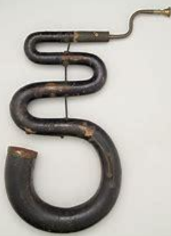
d) Named as it looks