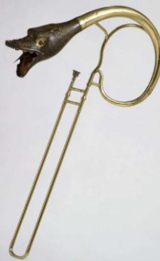
e) Ancient Roman instrument