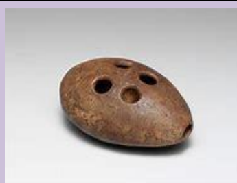
b) Chinese vessel flute, made of clay